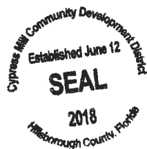
Official District Seal